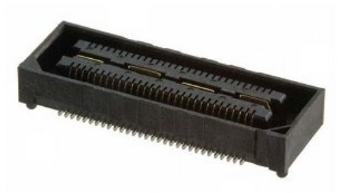
Figure 3: STM32L4 MIPI DSI Link QStrip Connector

The connection to the MIPI DSI link on the evaluation board is through a 60-pin high speed Q Strip Mezzanine connector. The display's FFC ribbon connection must be rerouted from the FPC input to a Q Strip output. The connector used for the conversion from ribbon to Q Strip is part number <u>QTH-030-01-L-</u> <u>D-A</u> from Samtec. The pin output description from the evaluation board can be found in the <u>user manual</u> of the processor.