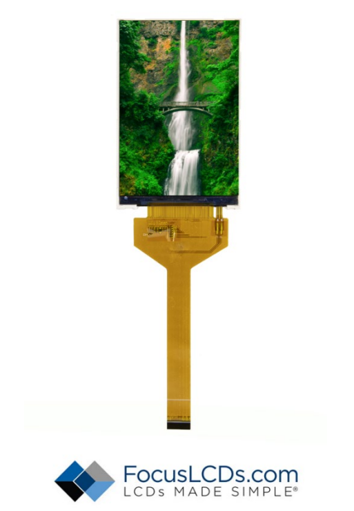
Figure 1: Focus LCDs E35KB-FW1000-N MIPI DSI Display

The MIPI DSI display interface has two modes of operation. The mode that will be discussed in this application note is the command mode. The command mode is used when the display has available memory to store image data. The display contains an internal IC that controls memory and display functions. The command mode of the MIPI DSI interface is similar to other display interfaces where control is done through command registers. These registers are defined by the controller to access and mange internal memory.