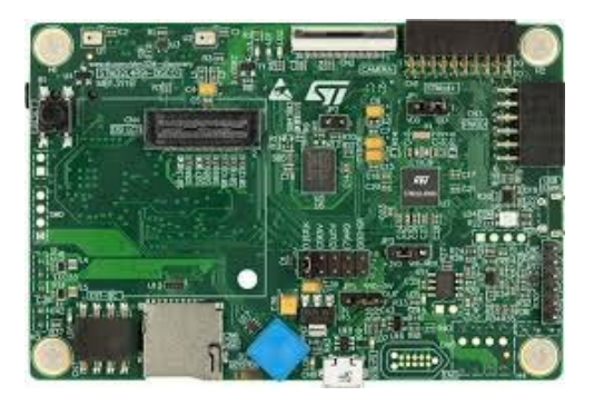
Figure 2: STM32L4R9I-Discovery Microcontroller

The display is interfaced over the one lane MIPI interface at a clock speed of 500MB/s. The processor is programmed through the micro-USB ST-Link interface. There hardware connections between the board and the display are minimal and the only peripheral in this demonstration will be the display. Other applicable peripherals are available on the board such as a micro-SD port and an RGB camera.